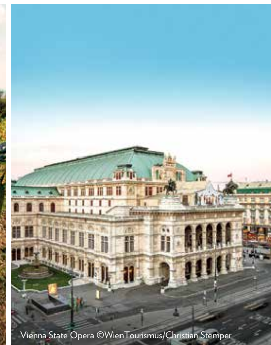
Vienna State Opera

As the first notes of “The Blue Danube” swell in the Musikverein’s Golden Hall, glorious acoustics send each note reverberating off the balconies and painted ceiling.