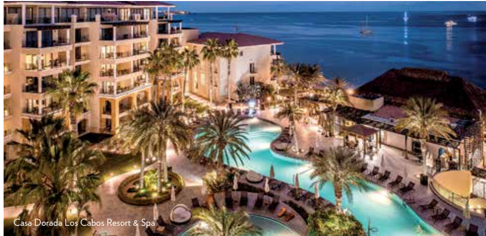
Casa Dorada Los Cabos Resort & Spa