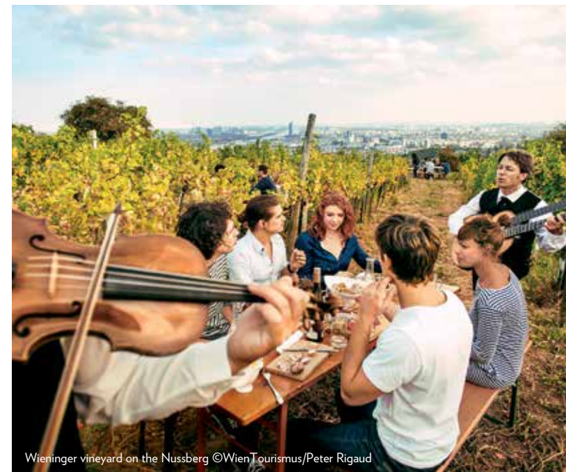
Wieninger vineyard on the Nussberg