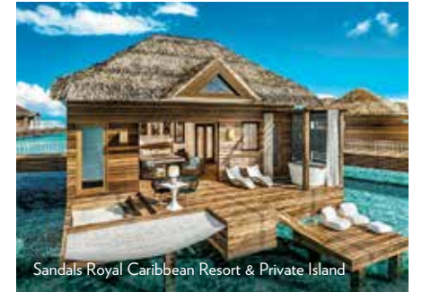
Sandals Royal Caribbean Resort & Private Island