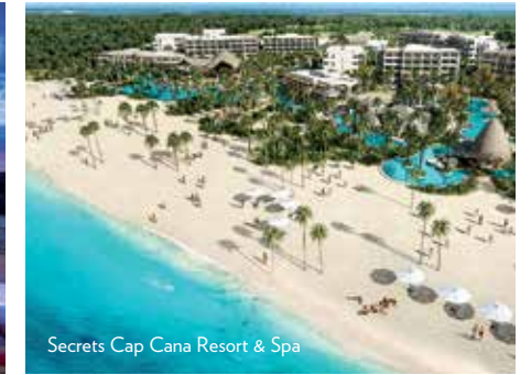
Secrets Cap Cana Resort & Spa