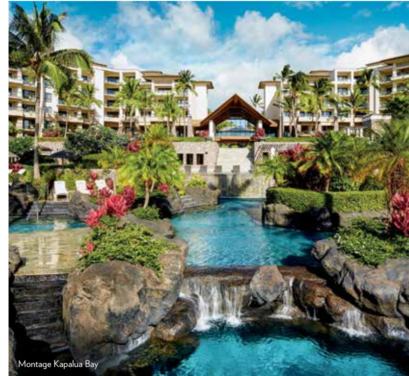
Montage Kapalua Bay