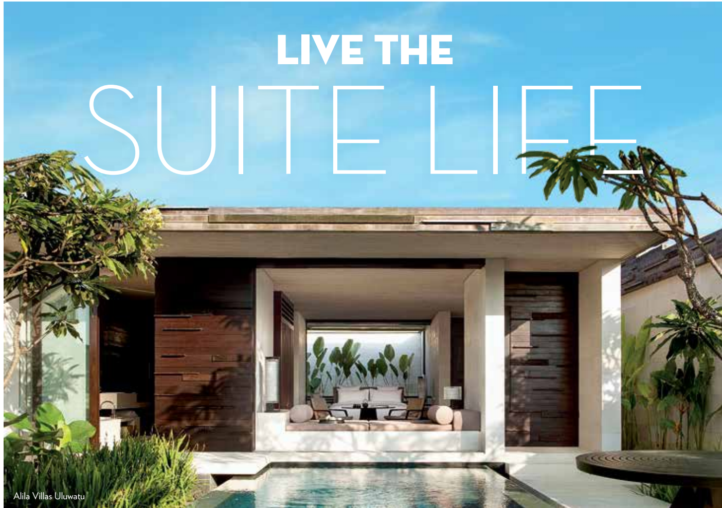
Alila Villas Uluwatu