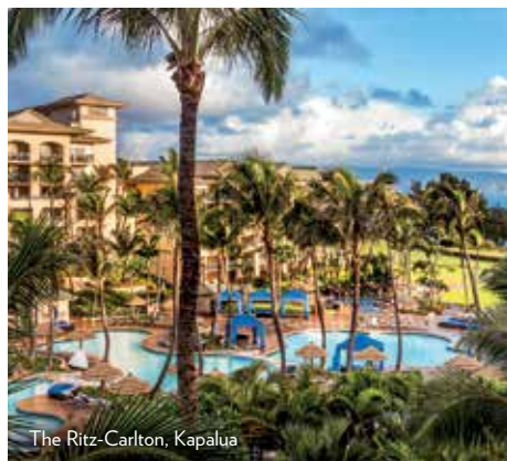
The Ritz-Carlton, Kapalua