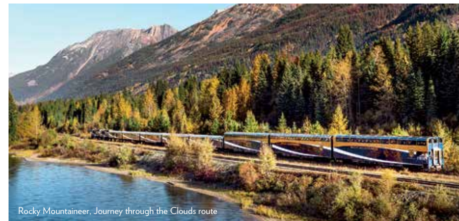
Rocky Mountaineer, Journey through the Clouds route

Prices are per person in U.S. dollars, land only (unless otherwise noted), based on double occupancy, subject to availability and change without notice and are not guaranteed until paid in full. Prices and amenities may vary by category and travel date. International airfare is additional. Additional restrictions, terms and conditions may apply.