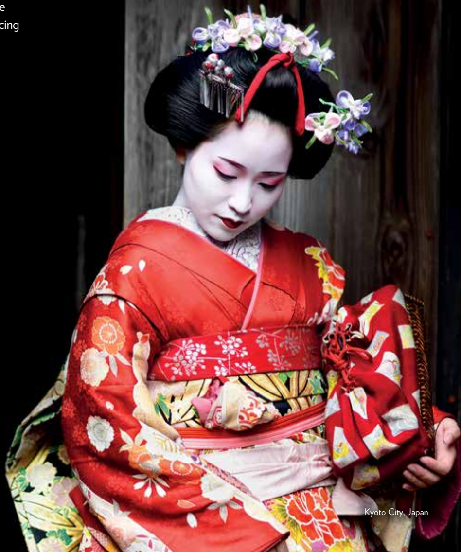
Kyoto City, Japan

Since meaningful experiences are the hallmarks of rewarding travel, we pair you with vacations that best match your travel style. Discover the breathtaking Scottish Highlands, admire Japan's UNESCO-listed sites or explore the Amazon rainforest in Peru. We work to ensure you receive the most exclusive pricing and benefits for your upcoming adventure.