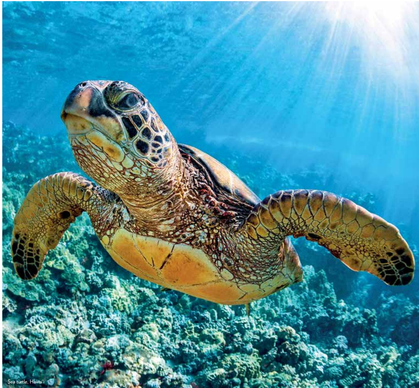
Sea turtle, Hawaii

Terms and Conditions: Information and pricing in this brochure are subject to change without notice and are not guaranteed until paid in full. All prices are per person, cruise or land only, based on double occupancy (unless otherwise noted) and may include early booking discounts. Prices vary by day of travel, season, duration, category stateroom and are subject to availability at time of booking. International airfare is additional. Certain blackout dates and restrictions may apply. Air, immigration and/or other government fees and taxes are not included unless otherwise noted. Airline tickets, tours and cruise packages are subject to supplemental increases that may be imposed after the date of purchase due to additional costs imposed by a supplier or government. Refer to each individual tour operator's/cruise line's published brochure for details on inclusions, as well as terms and conditions. This brochure has been produced for the exclusive use of Signature Travel Network member agencies only. All efforts have been made to ensure the accuracy of the information contained herein. Should an error occur, we reserve the right to correct it. Print Date: April 2017.