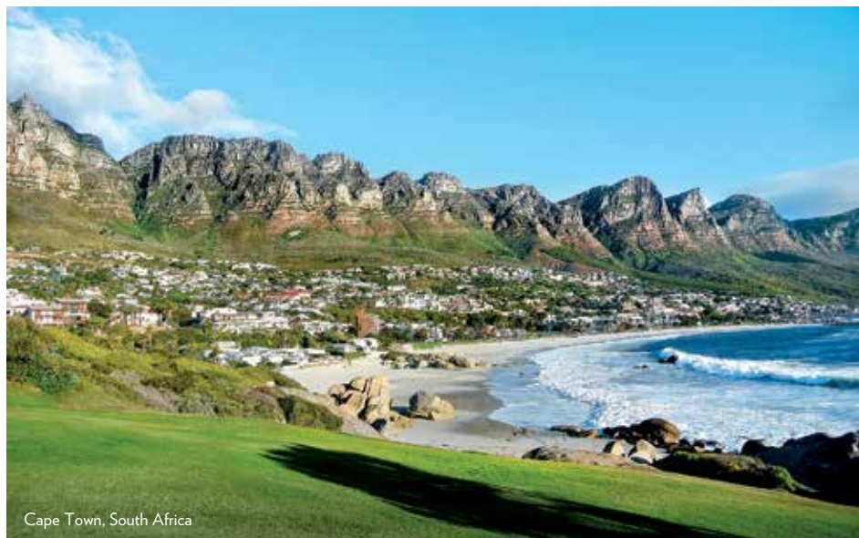
Cape Town, South Africa