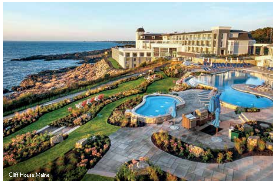
Cliff House Maine

Salamander Resort & Spa is close enough to Washington, D.C., that it's a favorite among politicians and dignitaries, yet Northern Virginia's rolling meadows feel like they're in another world altogether. Set snugly amidst the foothills of the Blue Ridge Mountains, the estate's 340 acres encompass myriad ways to apply your $100 resort credit: enlist one of the equestrian center's prized steeds to show you the countryside on horseback or reap the benefits of Virginia's wine country with a crushed cabernet spa treatment. Add a new recipe to your arsenal under the tutelage of a visiting D.C. chef in the hands-on Cooking Studio. Your culinary immersion extends into the evening at Harrimans with dinner fresh from the garden and a nightcap by the fire pit as the clear night sky lights up with twinkling stars.