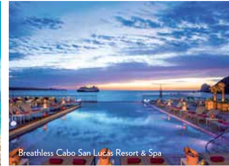
Breathless Cabo San Lucas Resort & Spa