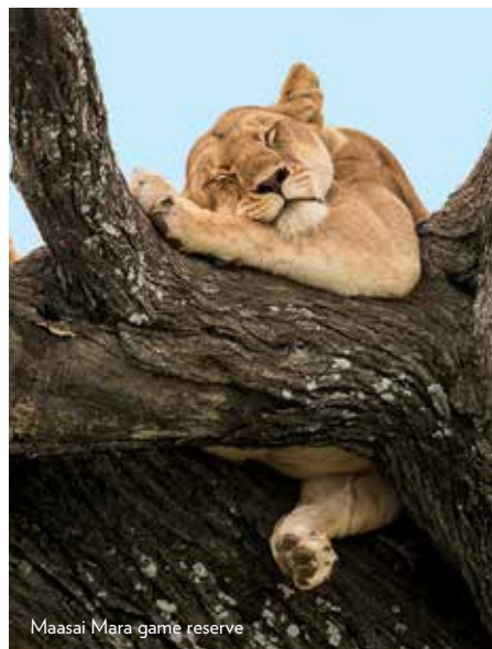
Maasai Mara game reserve