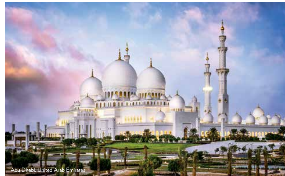
Abu Dhabi, United Arab Emirates

Featured prices are based on dates in bold. Prices are per person in U.S. dollars, cruise only, based on double occupancy, subject to availability and change without notice and are not guaranteed until paid in full. Port fees are not included. Prices and amenities may vary by category and travel date. International airfare is additional. Additional restrictions, terms and conditions may apply. Ship's Registry: Bahamas.