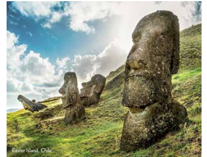
Easter Island, Chile

Ascend in harmony with the sun over the spectacular desert scenery of Sedona and Red Rock Country, where powerful vortexes release healing energies. Your day begins in a hot air balloon and ends with a soothing wrap or stone massage at the celebrated Mii amo spa.