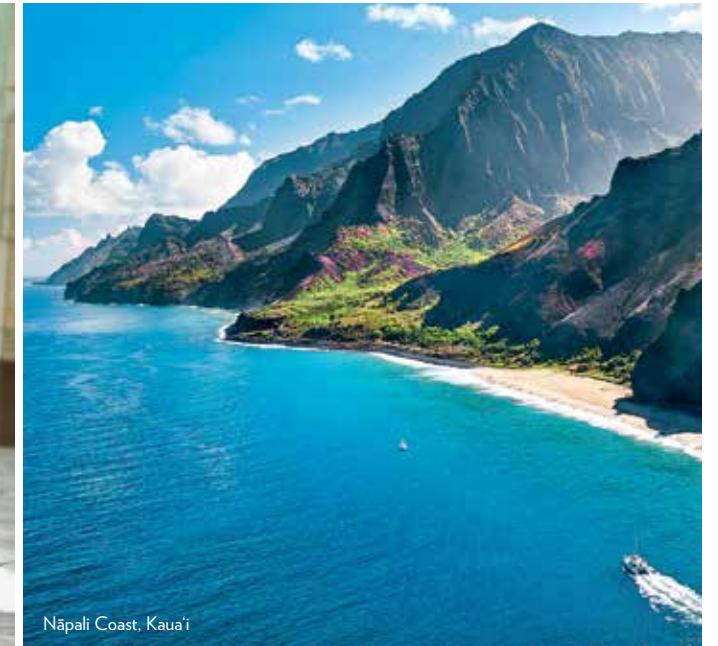
Nāpali Coast, Kaua'i

Renowned for its displays of tranquil blue seas framed by velvety cliffs, misty tropical rainforests and dramatic volcanic terrain, Hawaii's treasures go deeper than its sheer beauty. Bekah Wright reveals breathtaking adventures across Hawaii that are unique to each island where you can simply #LetHawaiiHappen.