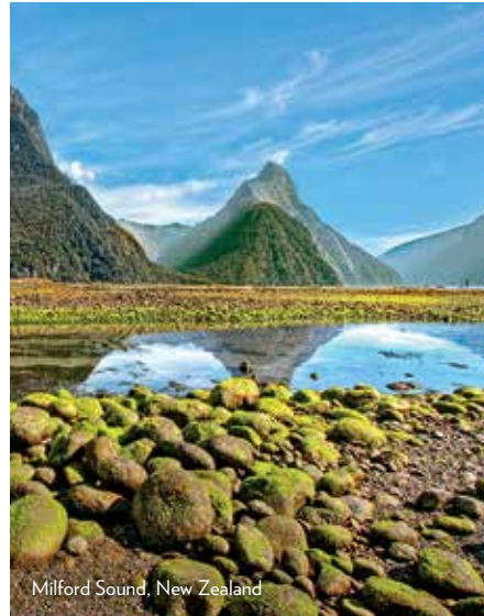
Milford Sound, New Zealand