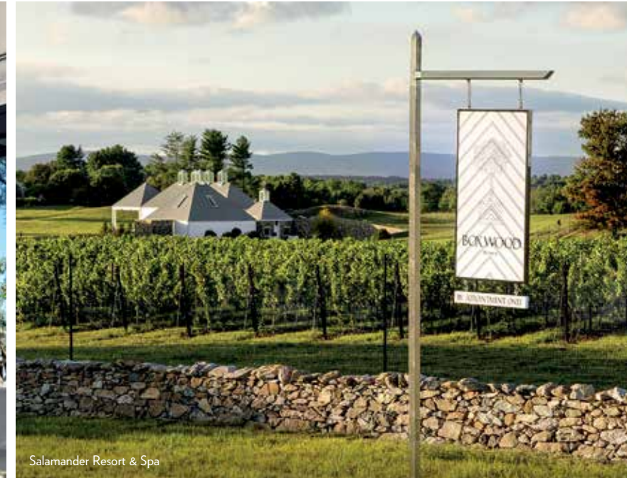
Salamander Resort & Spa