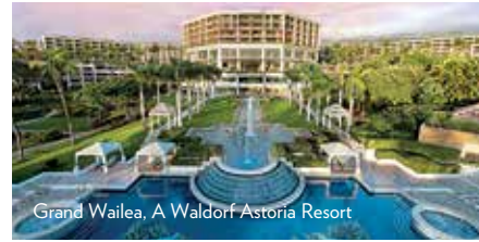
Grand Wailea, A Waldorf Astoria Resort