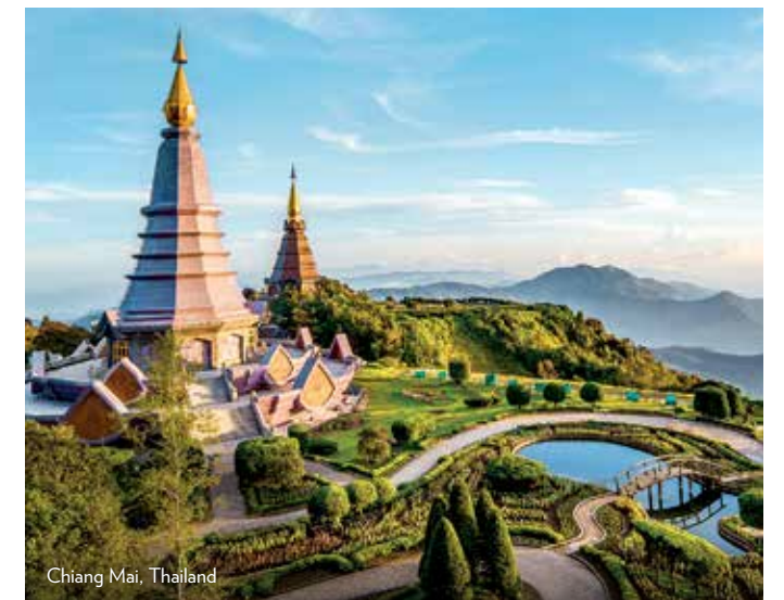
Chiang Mai, Thailand