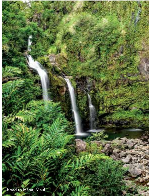
Road to Hāna, Maui