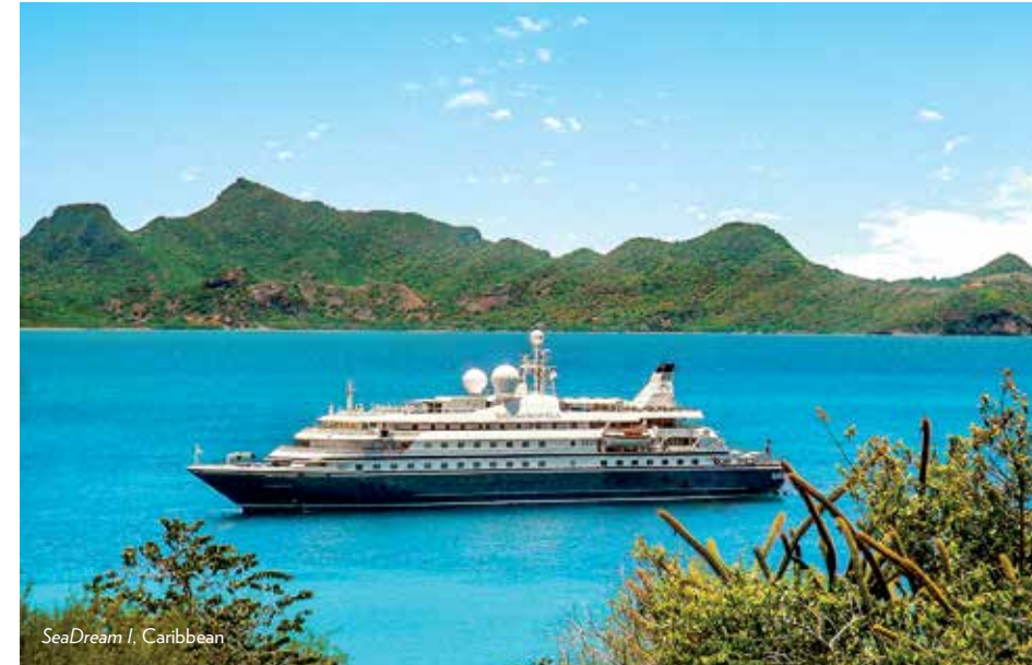
SeaDream I, Caribbean