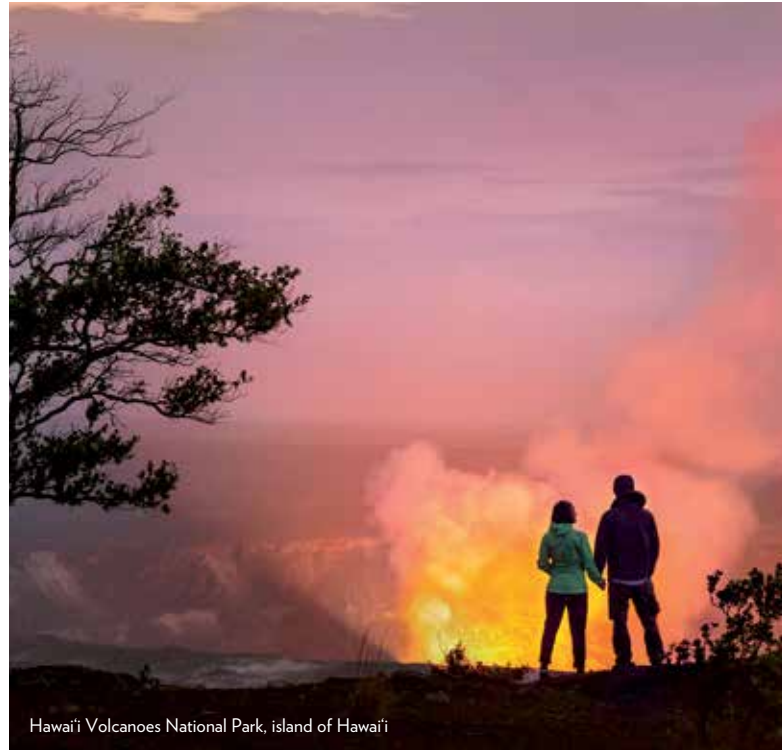
Hawai'i Volcanoes National Park, island of Hawai'i

exploring: inner tubing through the irrigation ditches of a former sugar plantation. This fun-filled activity traverses a darkened tunnel and cuts through Kaua'i's backcountry, offering a unique glimpse of the island's landscape.