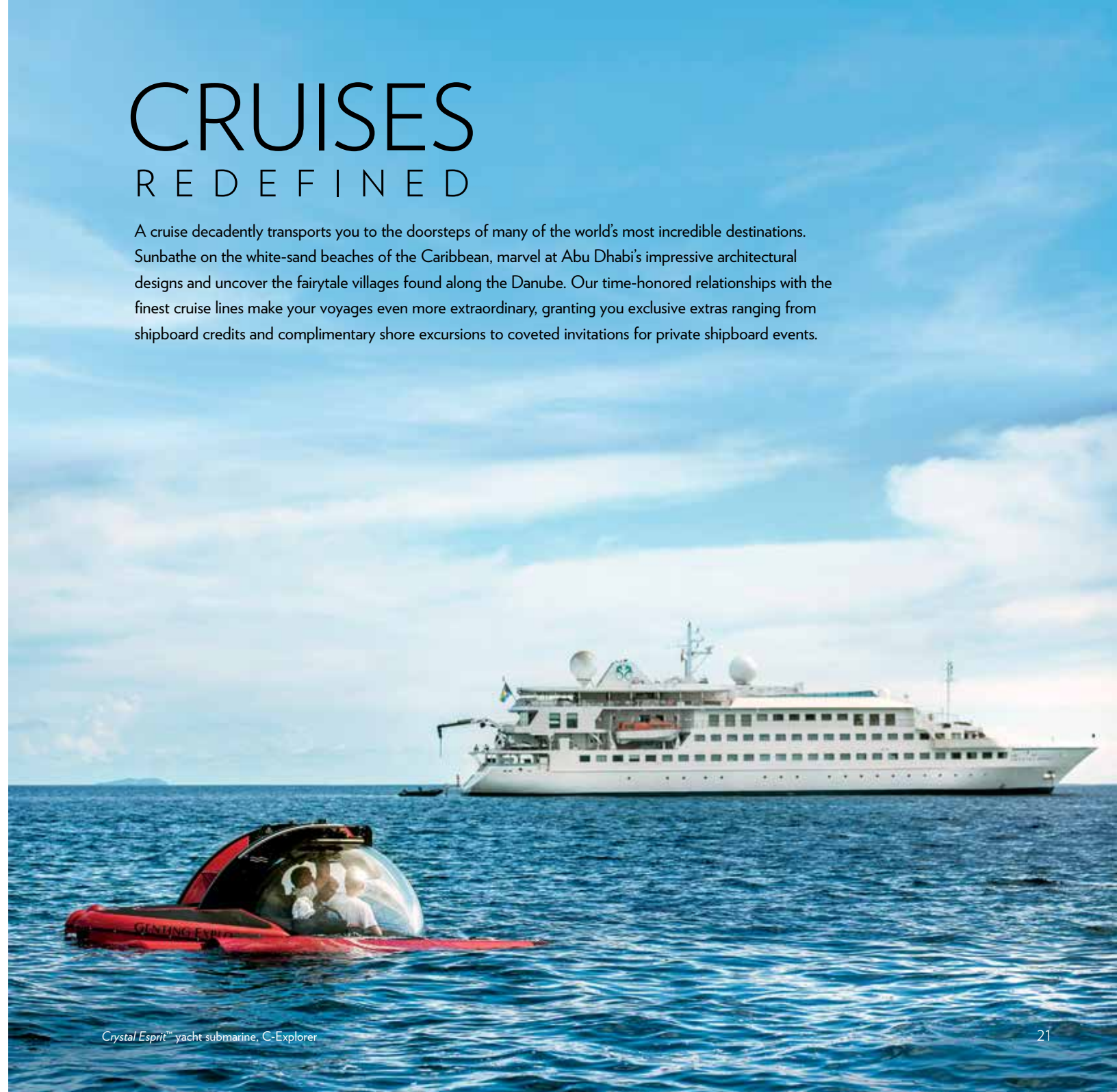
Crystal Esprit™ yacht submarine, C-Explorer

A cruise decadently transports you to the doorsteps of many of the world's most incredible destinations. Sunbathe on the white-sand beaches of the Caribbean, marvel at Abu Dhabi's impressive architectural designs and uncover the fairytale villages found along the Danube. Our time-honored relationships with the finest cruise lines make your voyages even more extraordinary, granting you exclusive extras ranging from shipboard credits and complimentary shore excursions to coveted invitations for private shipboard events.