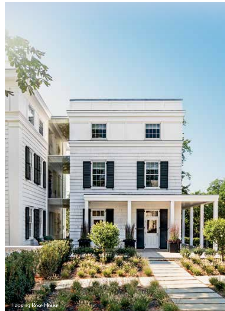
Topping Rose House

Newly opened Andaz Scottsdale Resort & Spa leaves nearby Phoenix behind for the artful energy of the Arizona desert. Wake feeling inspired in your casita-style bungalow and greet the day gazing at the peaks of Camelback Mountain. You'll keep the good vibes going in the invigorating eucalyptus steam room at Palo Verde Spa & Apothecary, then use your $100 credit to mingle with friends over craft cocktails and small plates at Weft & Warp Art Bar + Kitchen. See just how deep the creativity runs during a visit to Cattle Tracks Arts Compound, a unique artist collective that dates back to the 1930s. Your tour of the eclectic studios reveals works from local potters, jewelers, blacksmiths and performers, while artists reciprocate by visiting the resort to share their stories and artwork.