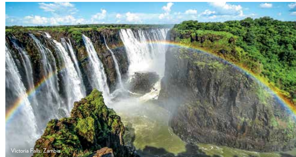
Victoria Falls, Zambia