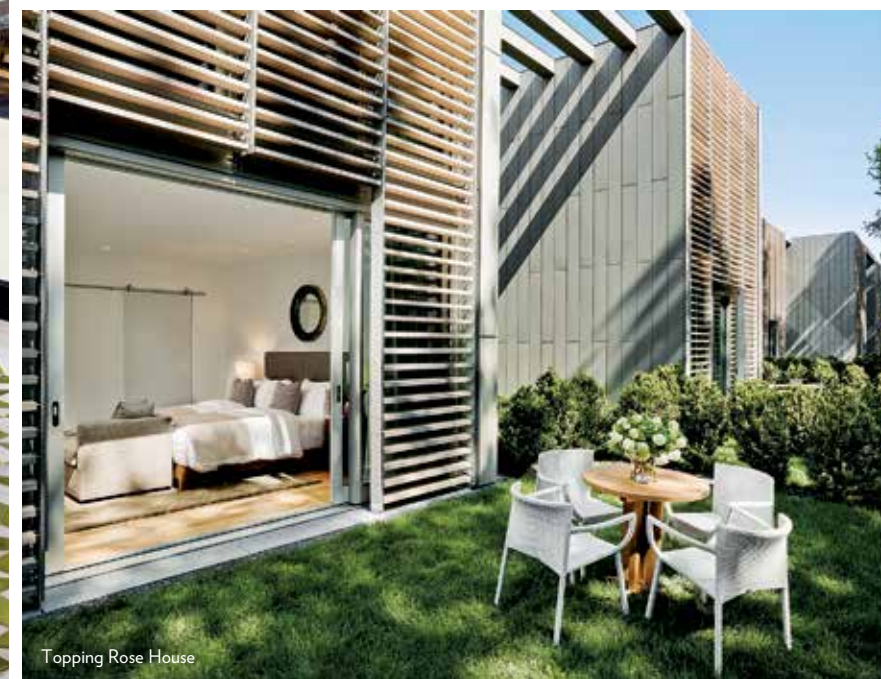
Topping Rose House

Whether you seek a weekend escape or a weeklong getaway, a peaceful oasis awaits right here in the U.S. Discover just a few of our favorite retreats among our extensive Hotels & Resorts Collection.