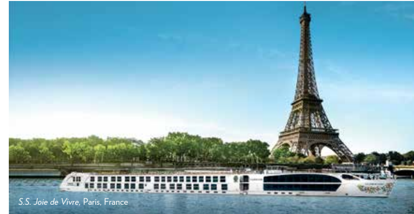
S.S. Joie de Vivre, Paris, France