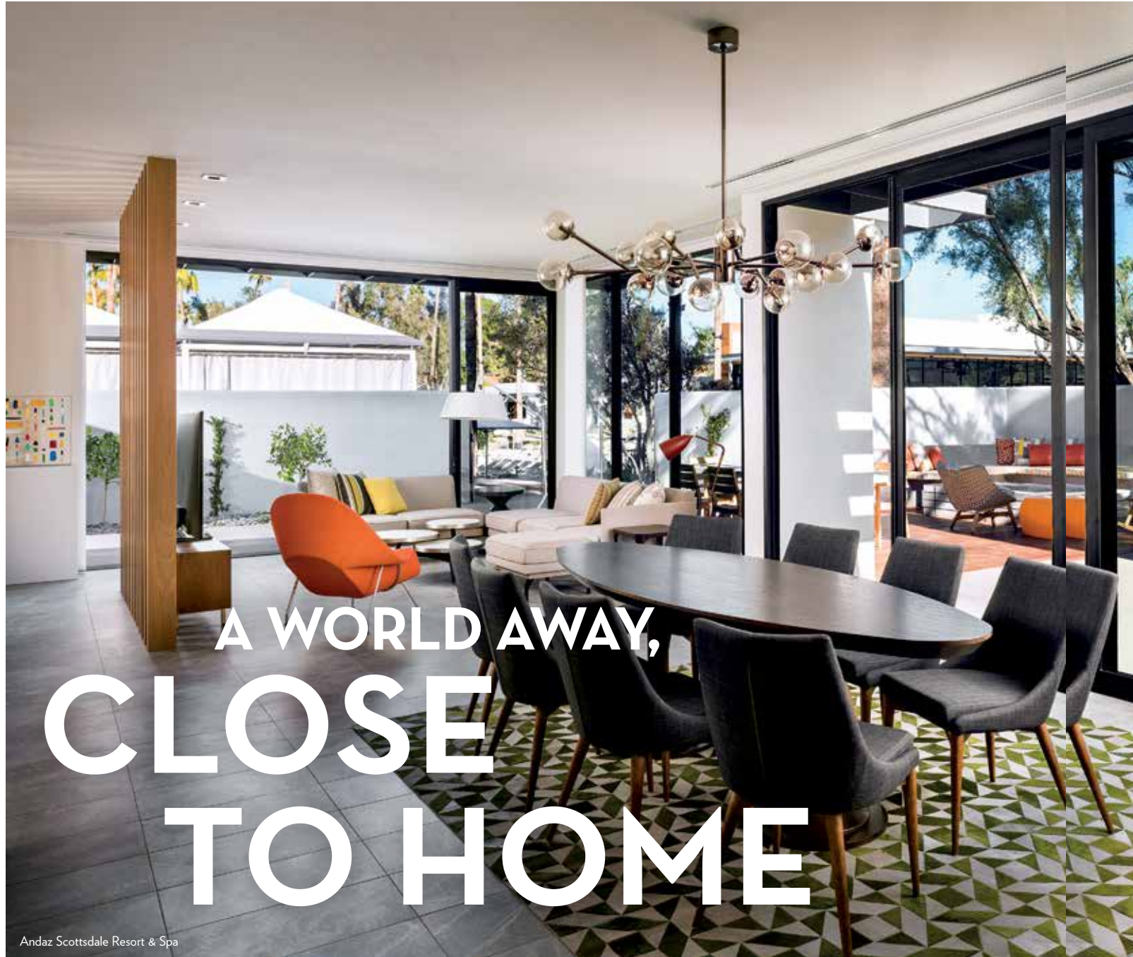
Andaz Scottsdale Resort & Spa