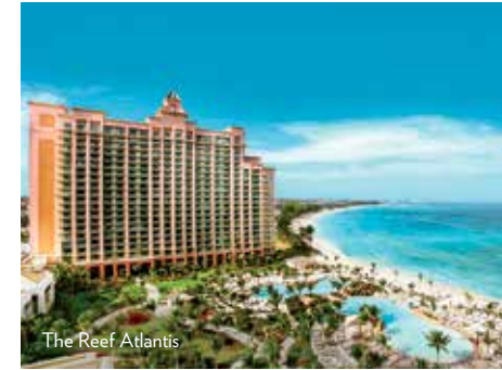
The Reef Atlantis