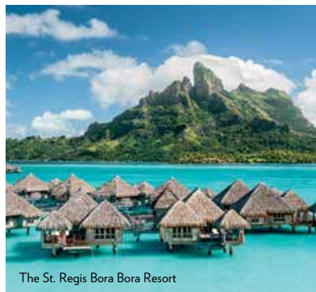
The St. Regis Bora Bora Resort