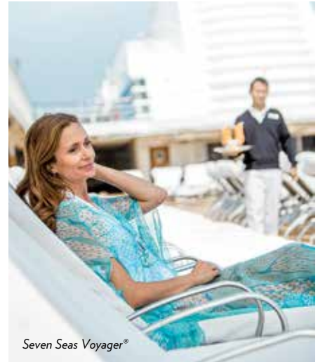
Seven Seas Voyager®