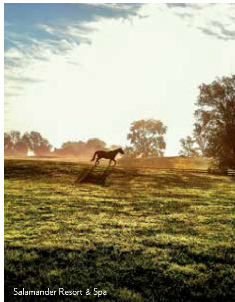
Salamander Resort & Spa